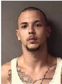
Jeffrey Adams Firearms; Poss. by SVF