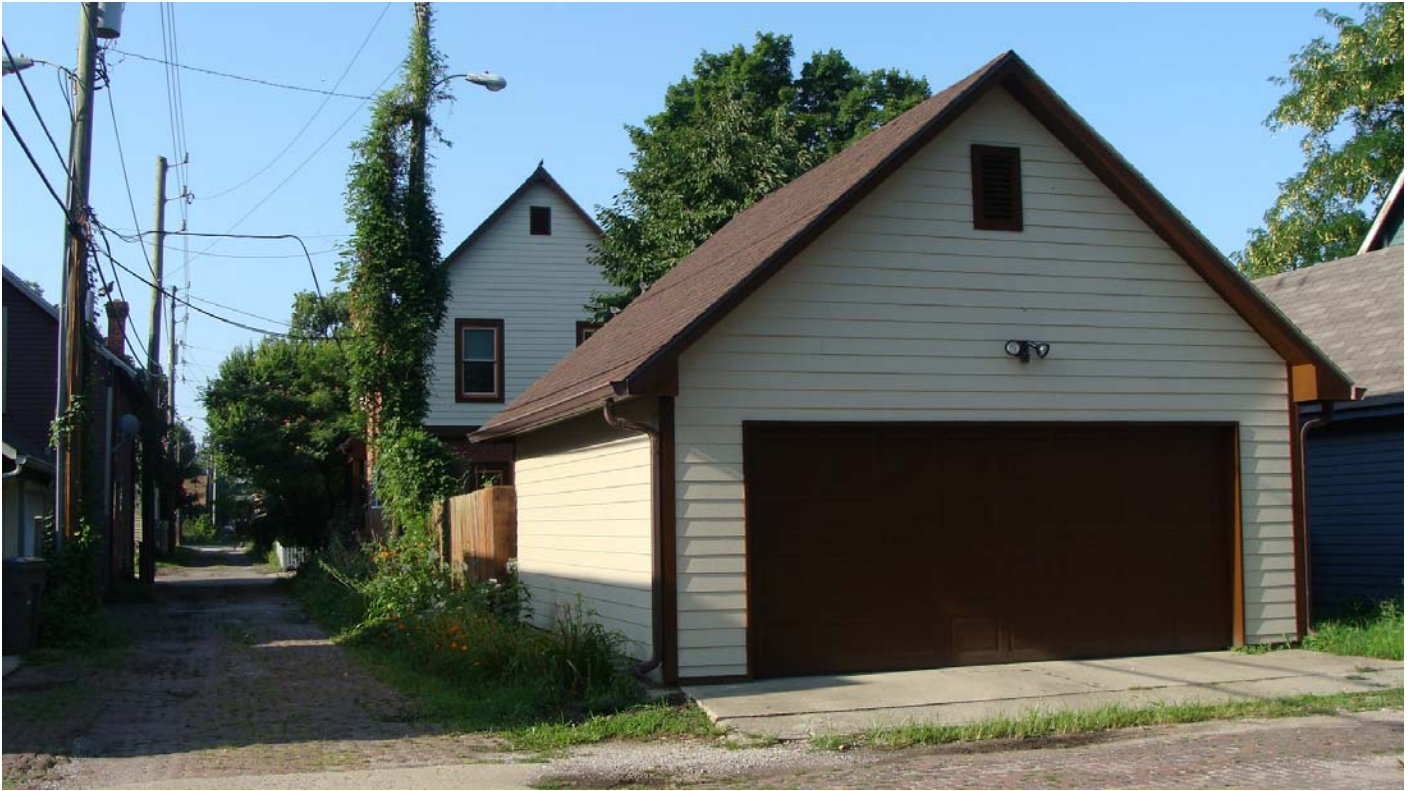
View of detached garage seen from the intersection of the rear alleys