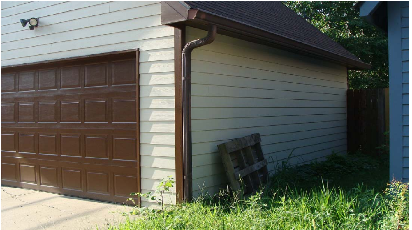
View looking at the northwest corner of the garage seen from the alley