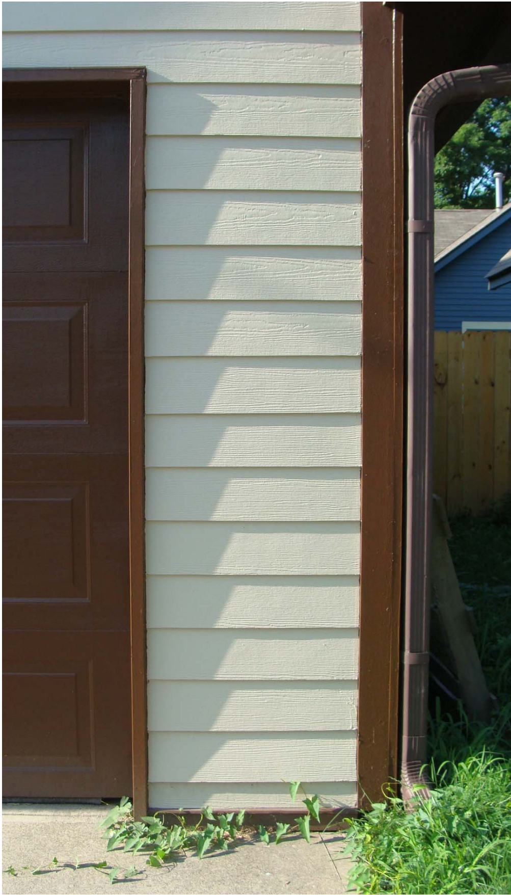
Detail of rough-sawn embossed surface texture evident on the detached garage