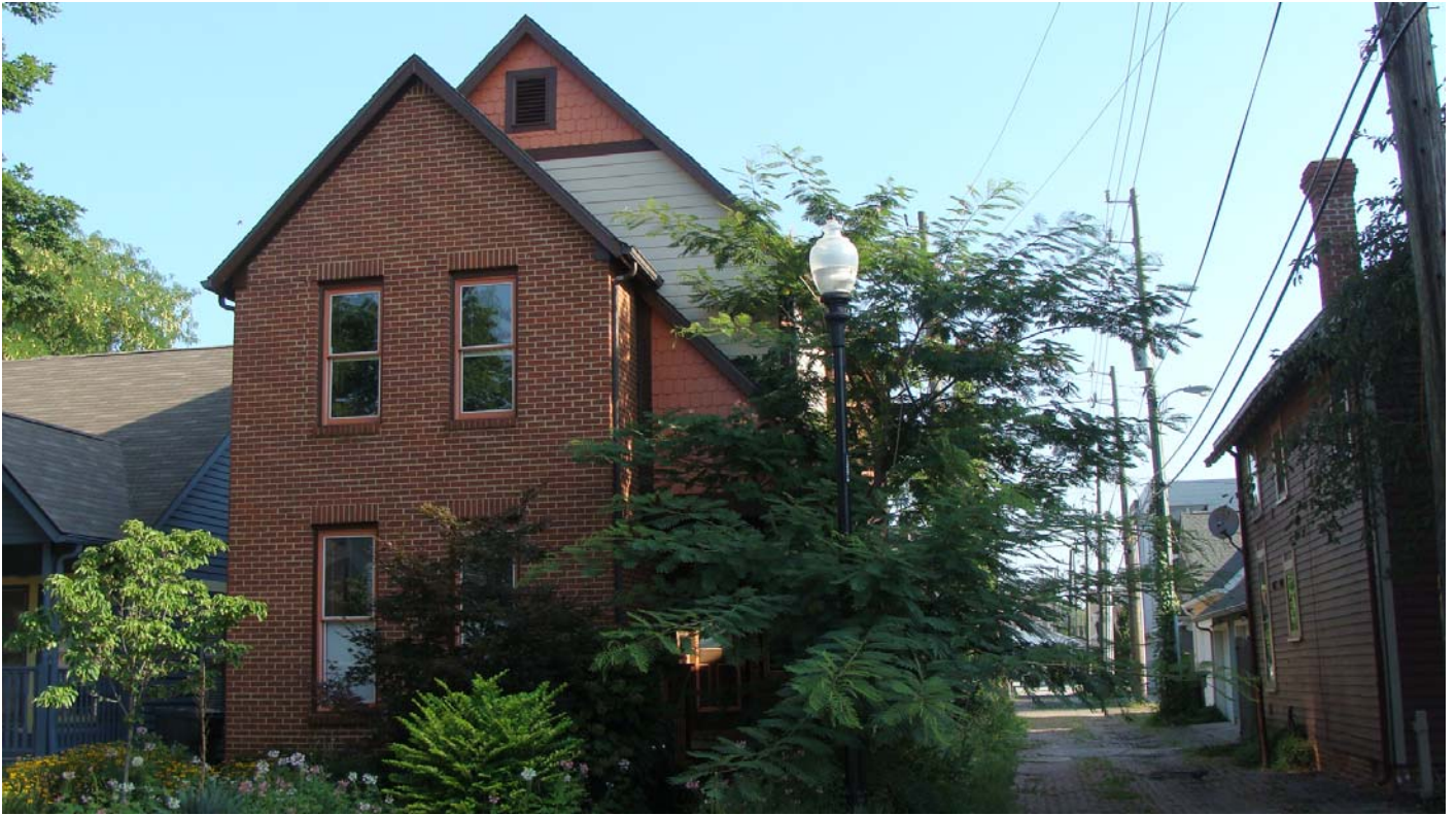
View of front of primary structure