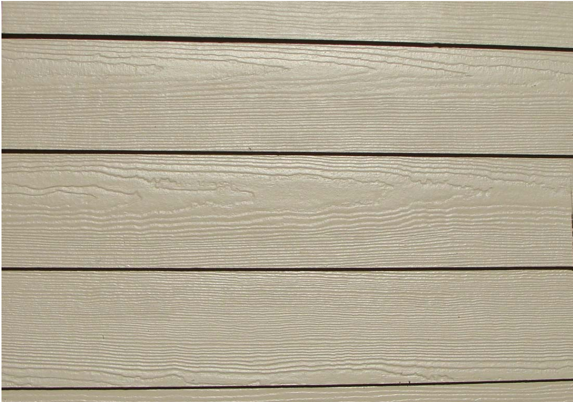
Close up view of siding texture