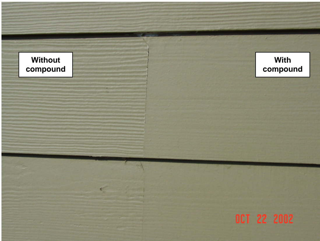
View of siding with and without Elastomeric Patching Compound on similar property in St. Joseph Historic District approved in November 2002