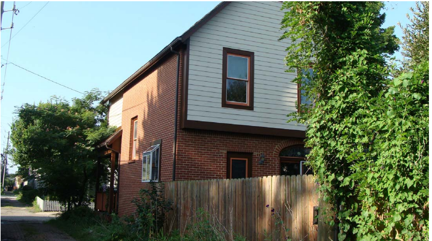
View of back of primary structure seen from the adjacent alley