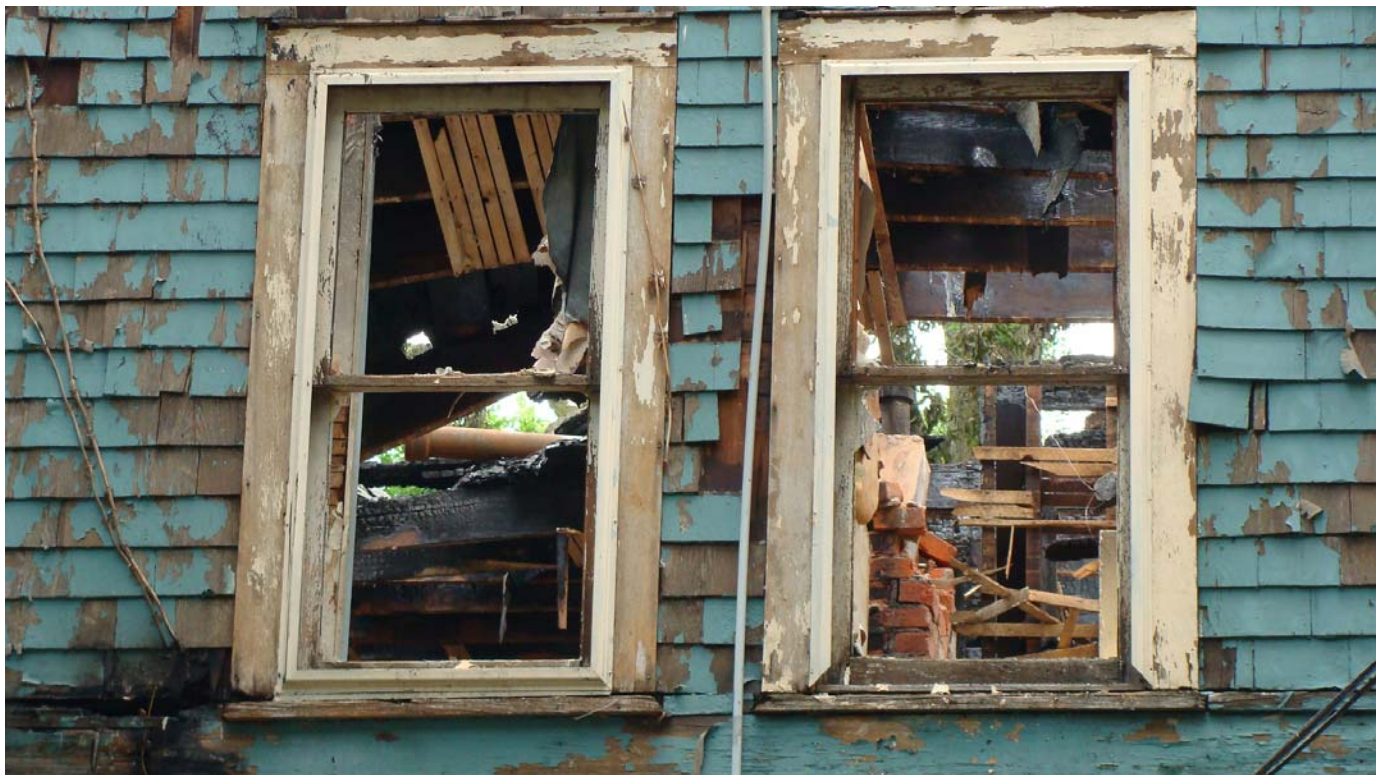
Close up of second floor rear windows- windows were blown out