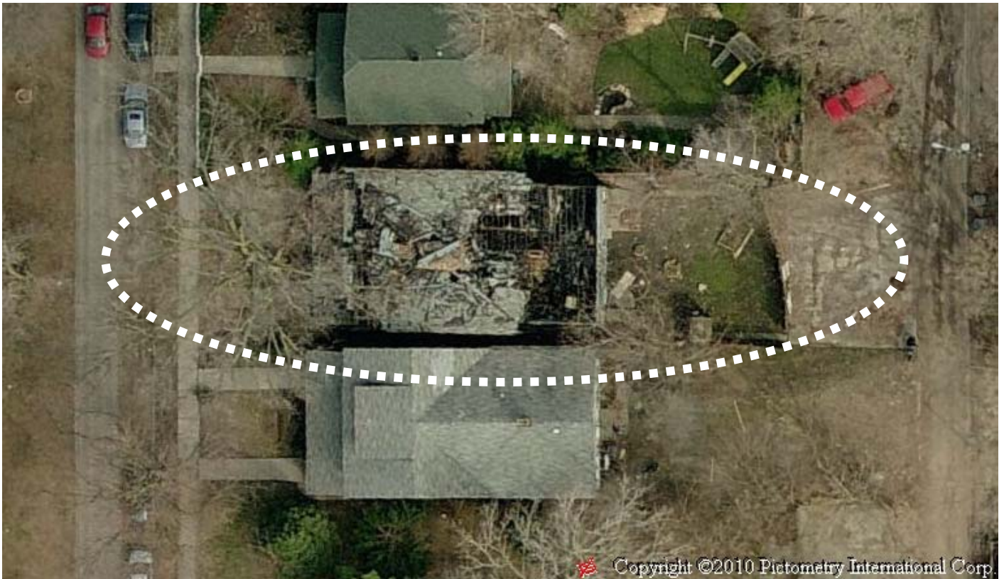
Aerial photo showing roof shortly after the fire, but prior to the remainder of the roof being removed as part of the emergency demolition.