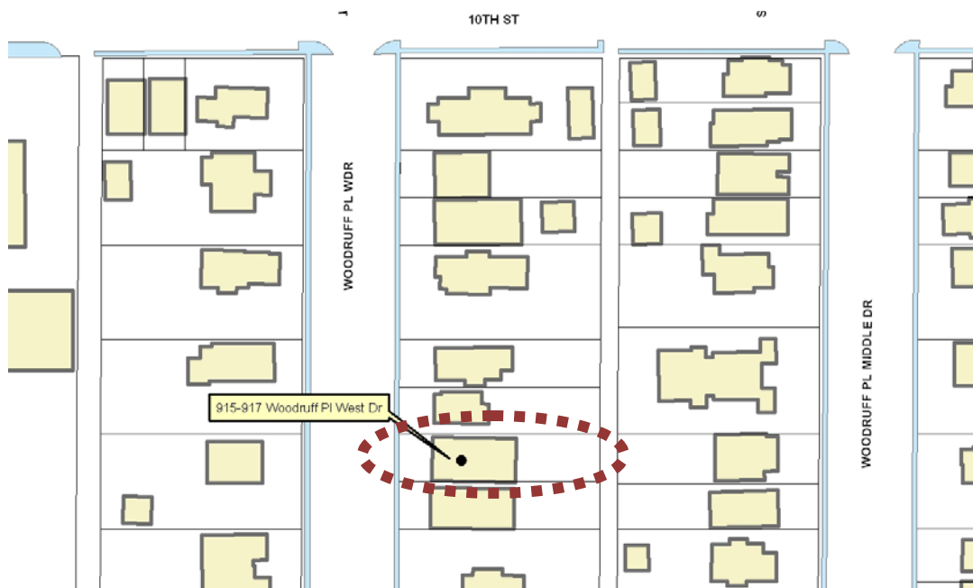
Map of subject property