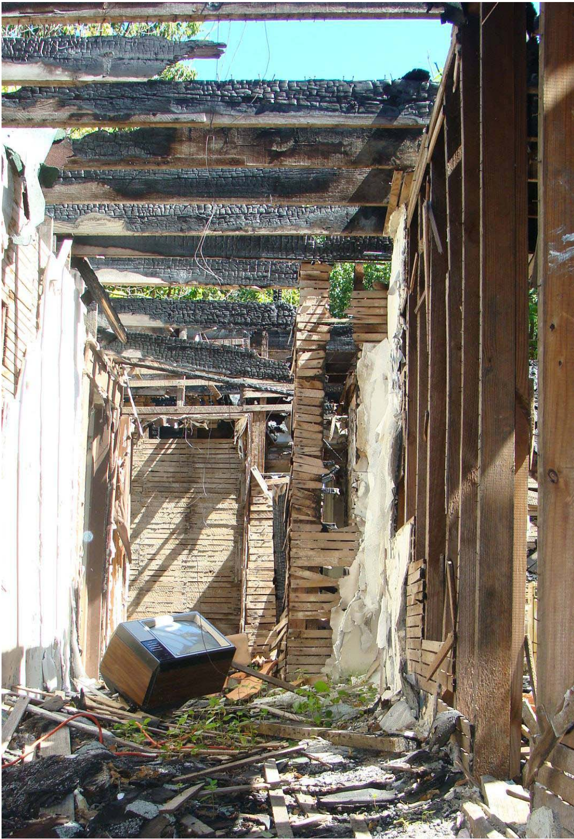
Interior at second floor