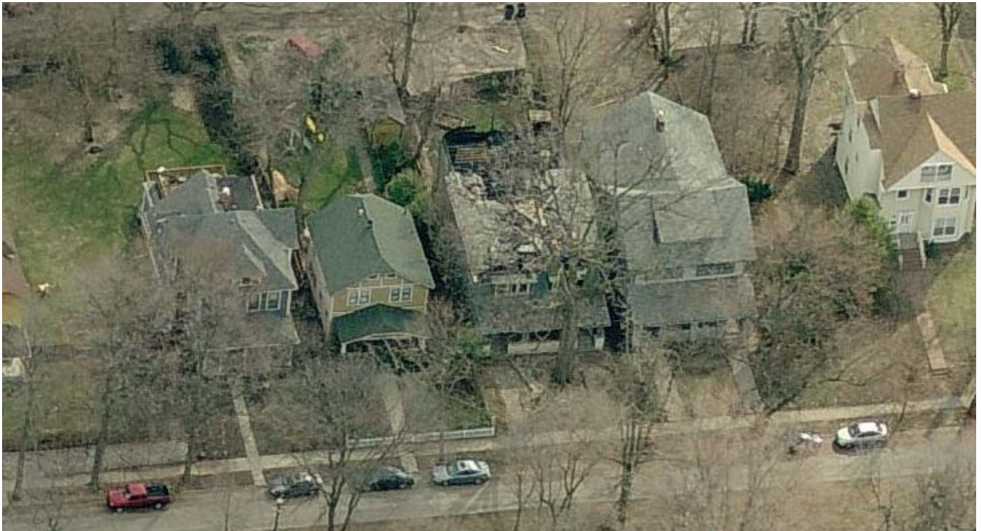
Aerial photo looking east toward the front of the house