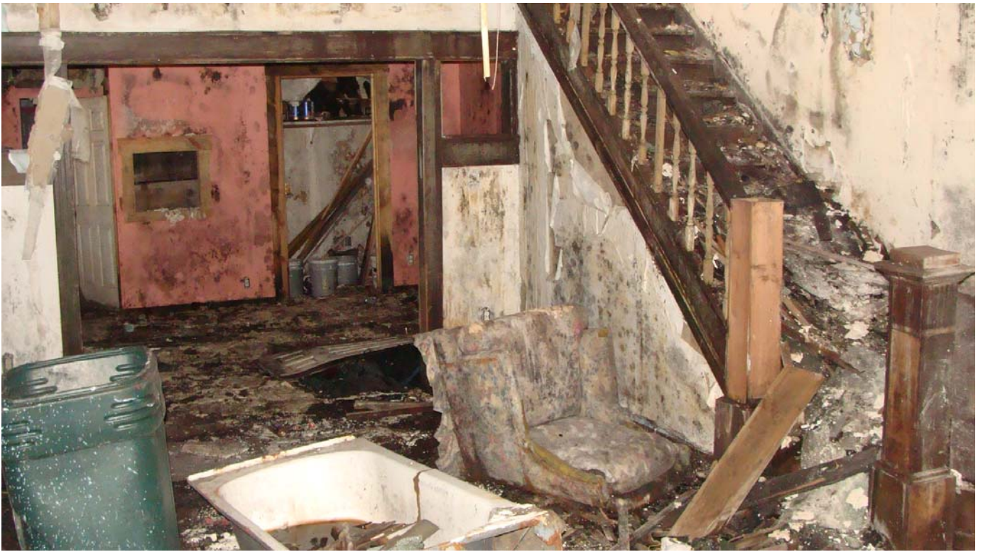
Interior at first floor- Black mold covers the area