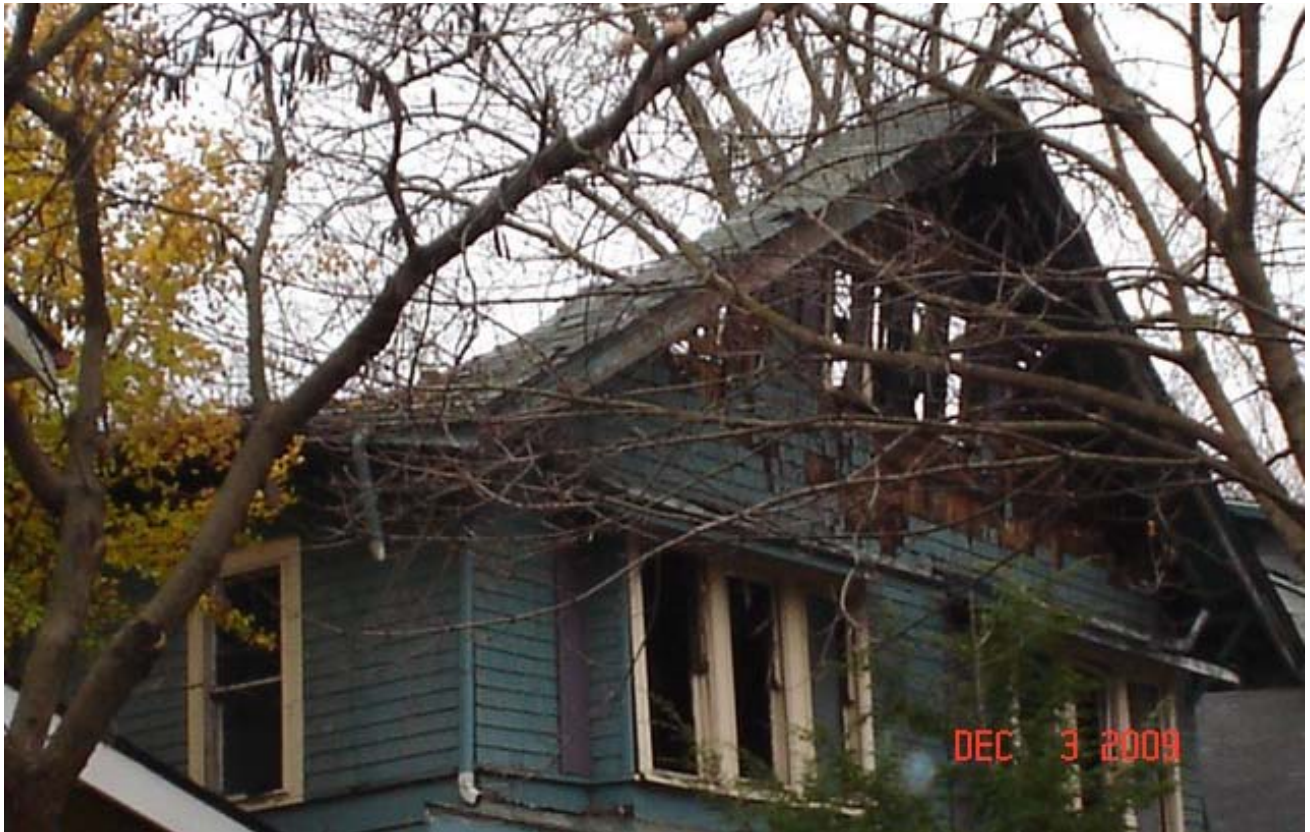
December 2009 – front gable required emergency demolition