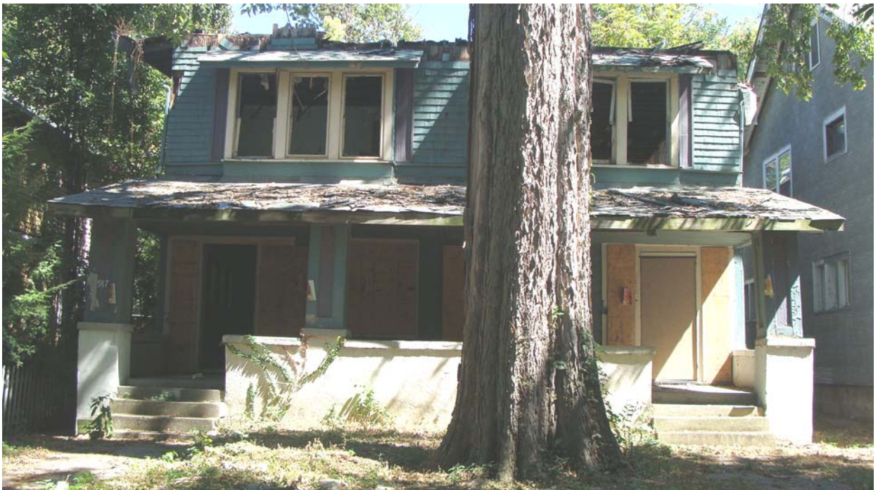
Front of house today