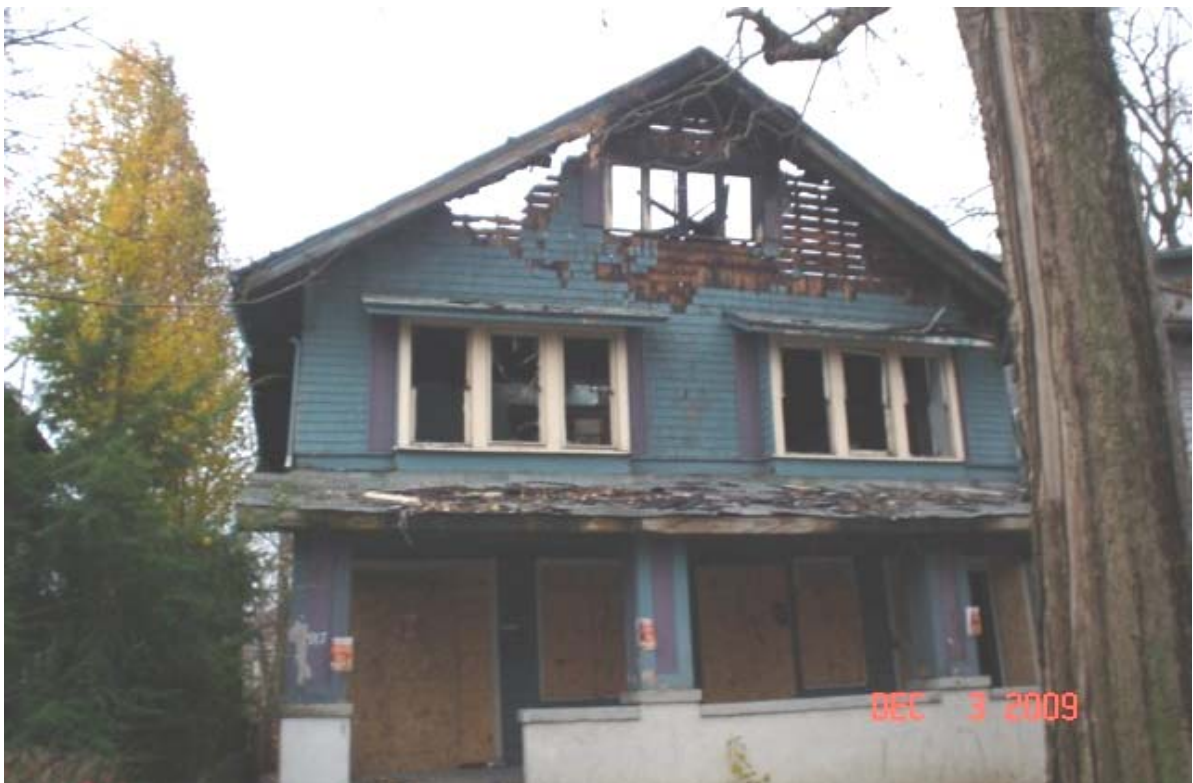
Decemer 2009- front of house before gable was removed by emergency demolition