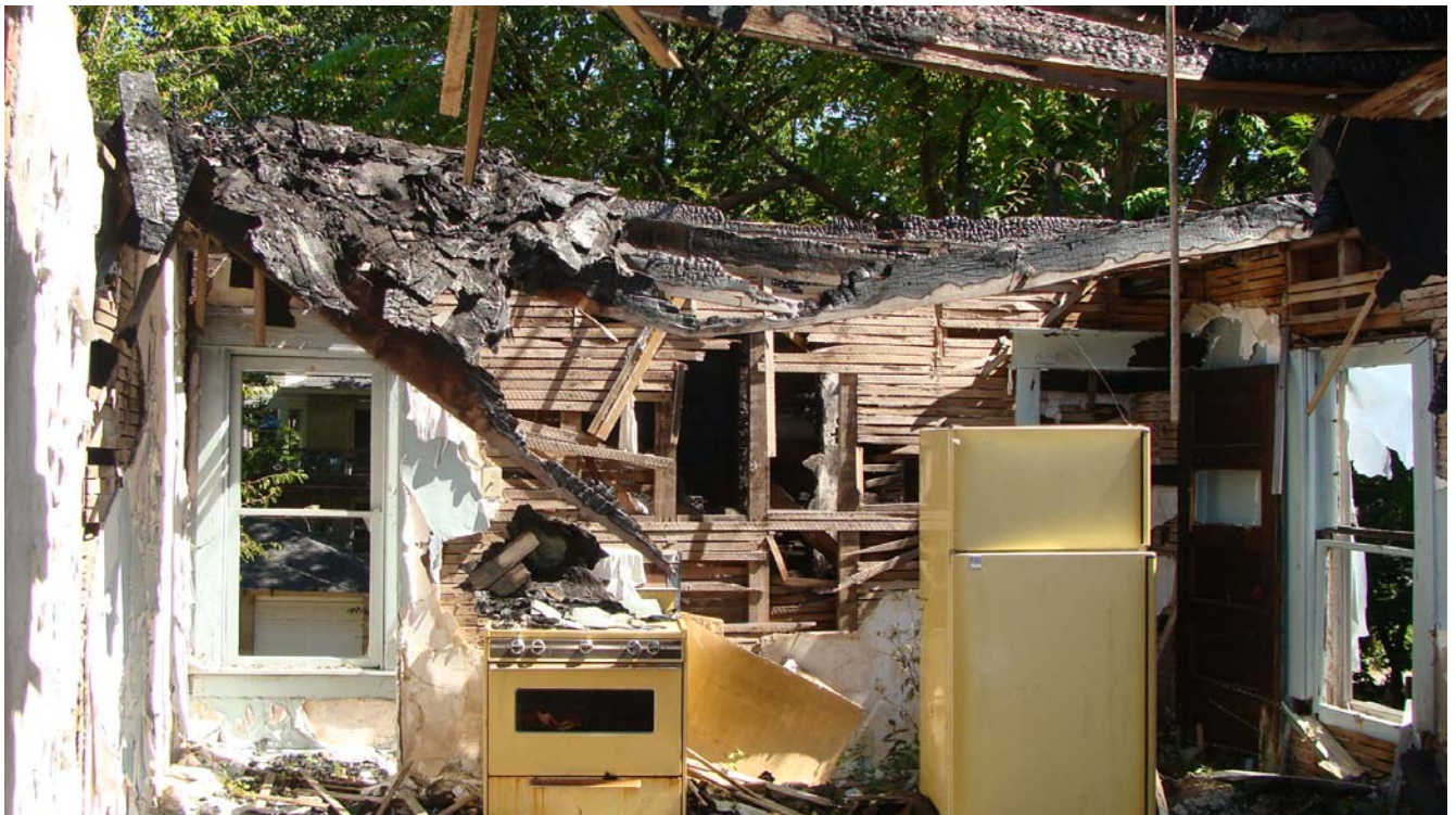
Interior at second floor- No roof remains