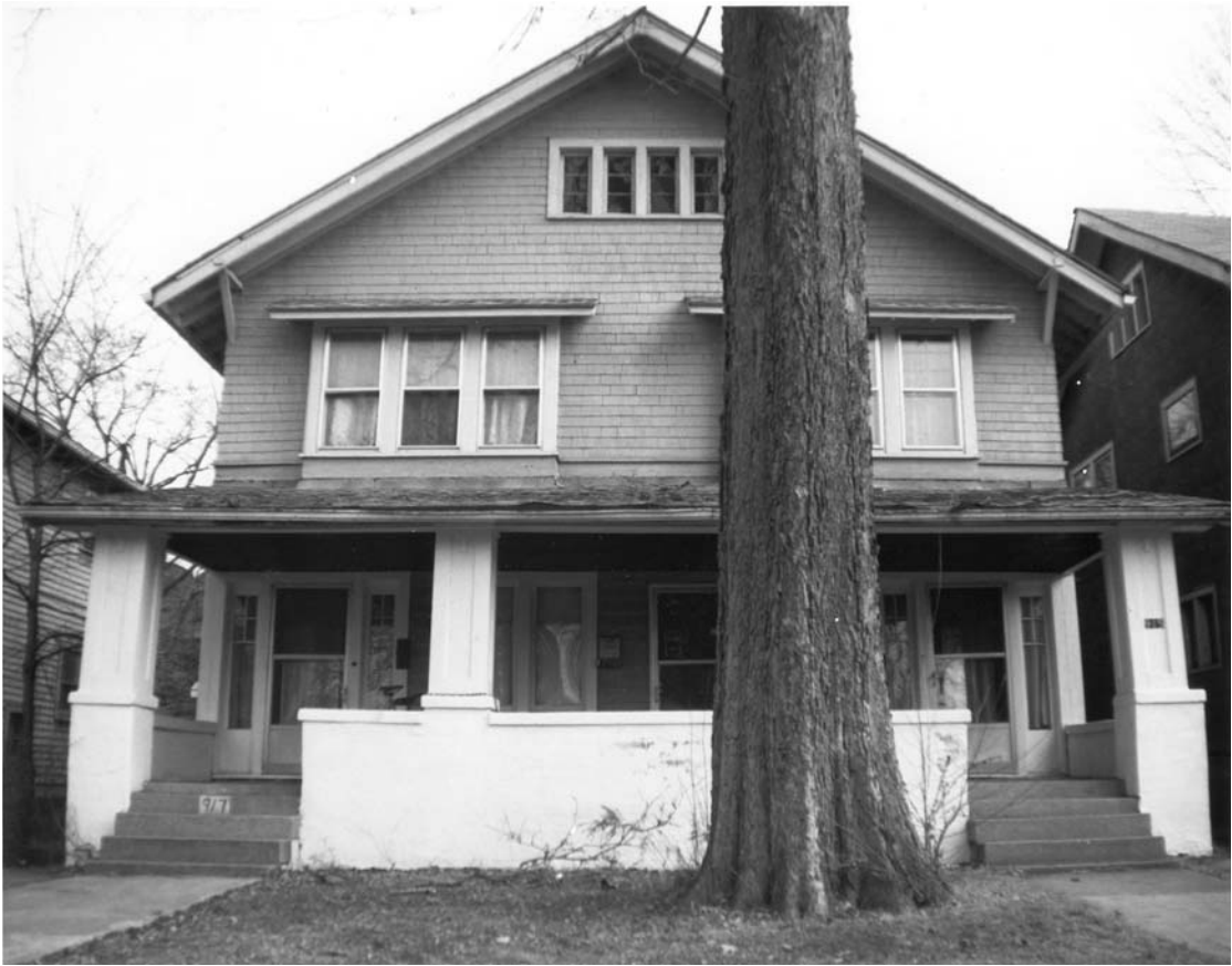
Mid-1970's photo of house