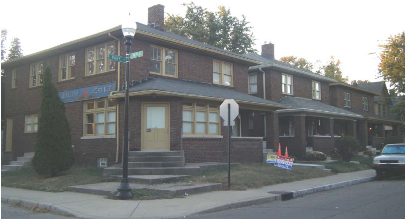
The three adjacent double residences – 851-53 is the 3 rd building on the right side of this photo