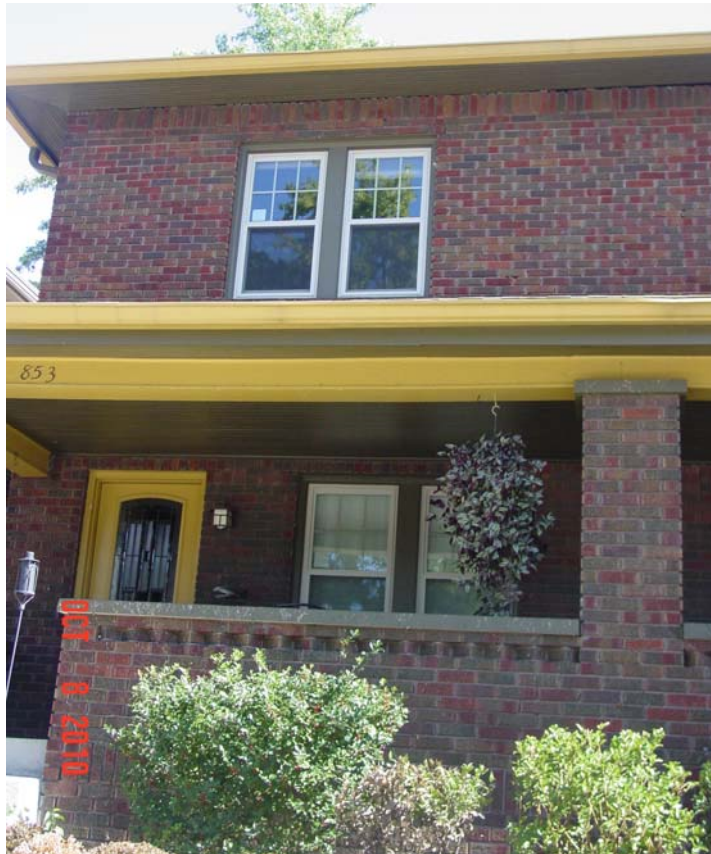
Post window replacement – example of 6 over 1 windows installed on north unit, west side of building.