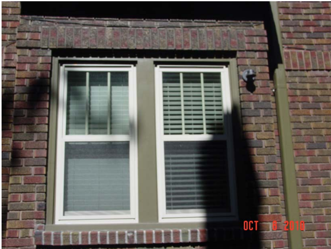
Replacement windows – 3 over 1 installed on south side of building