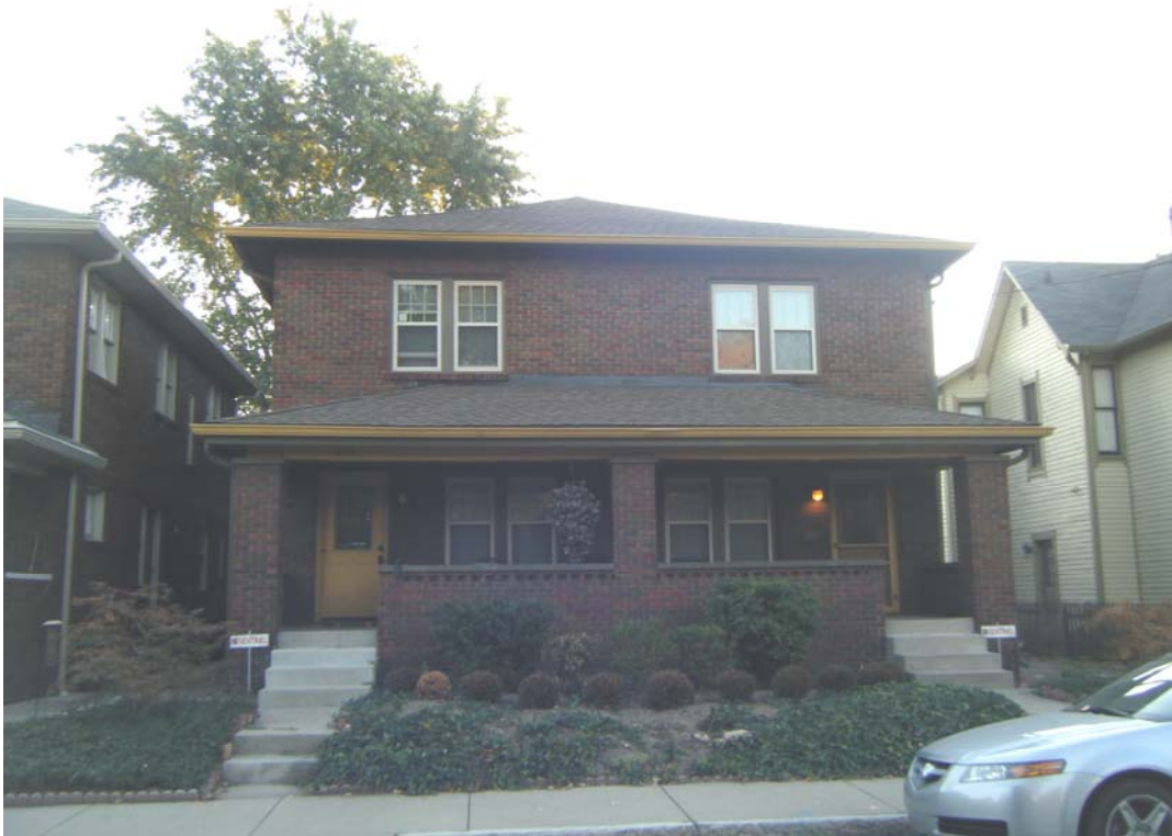
851-53 N Park after replacement window installation