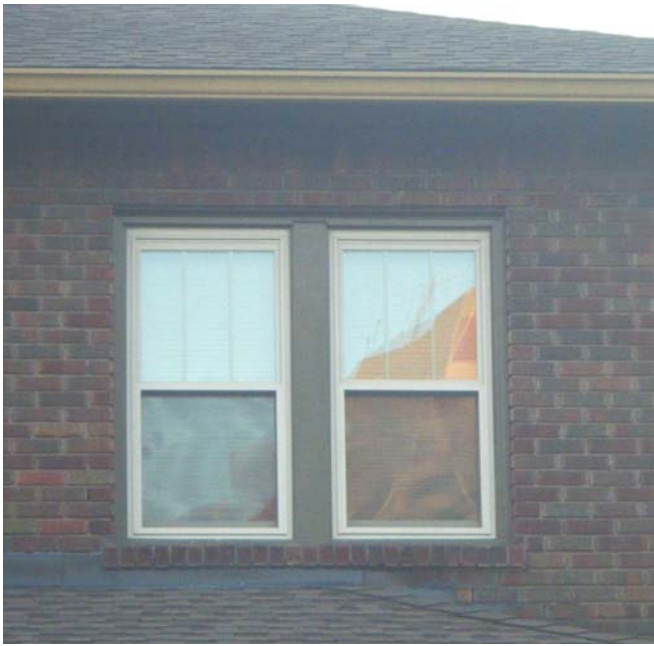
Replacement windows – 3 over 1 installed on front façade