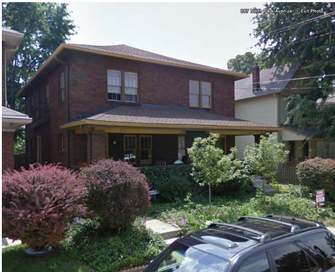
851-53 N Park prior to replacement window installation