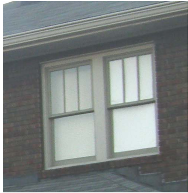
Example of wood windows still in place on house to north