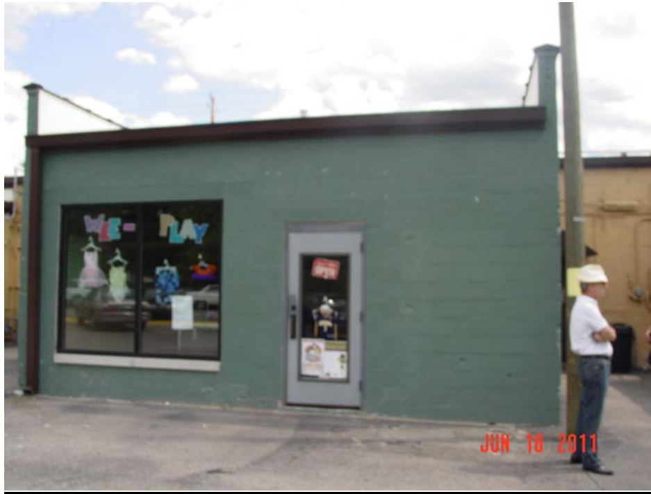
Above: Rear microbrewery space Below: View of dumpster location (only one dumpster seen here)