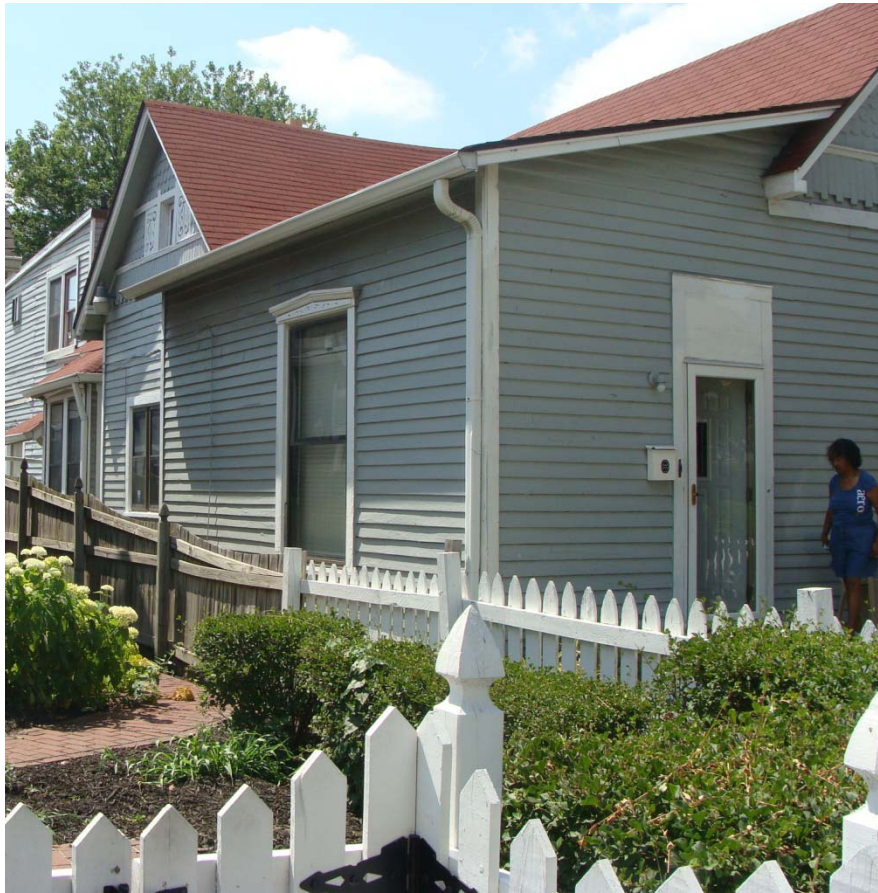
View of south façade