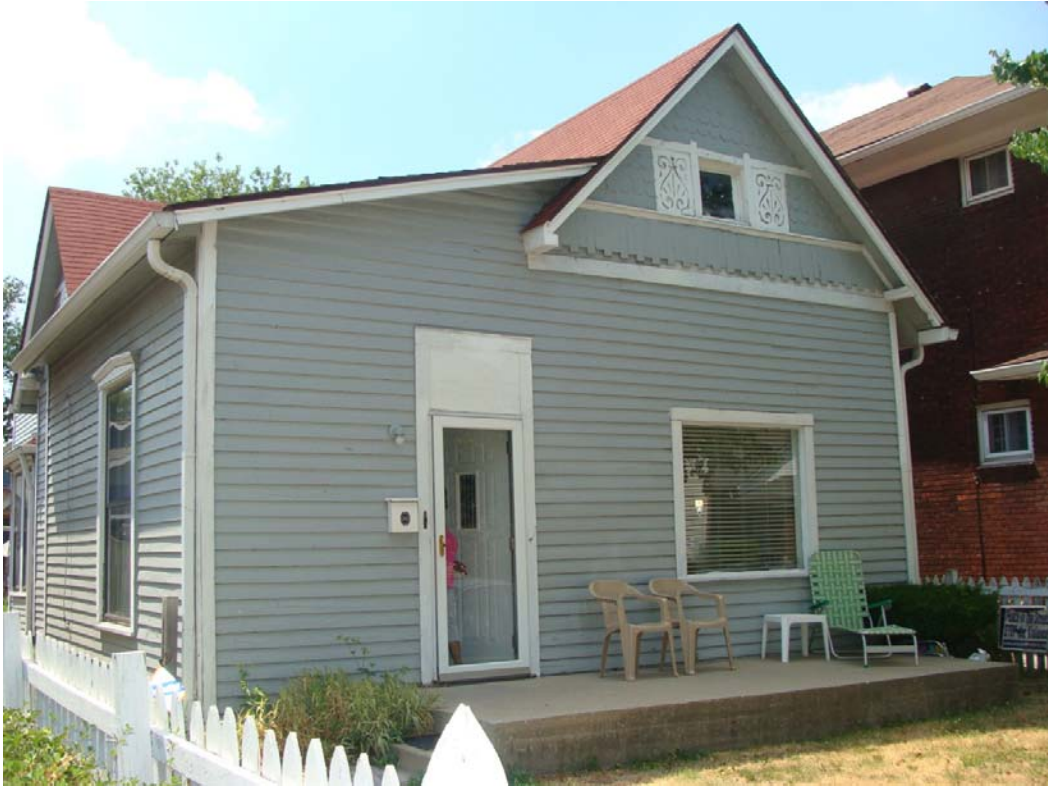
View of property – front (east) façade