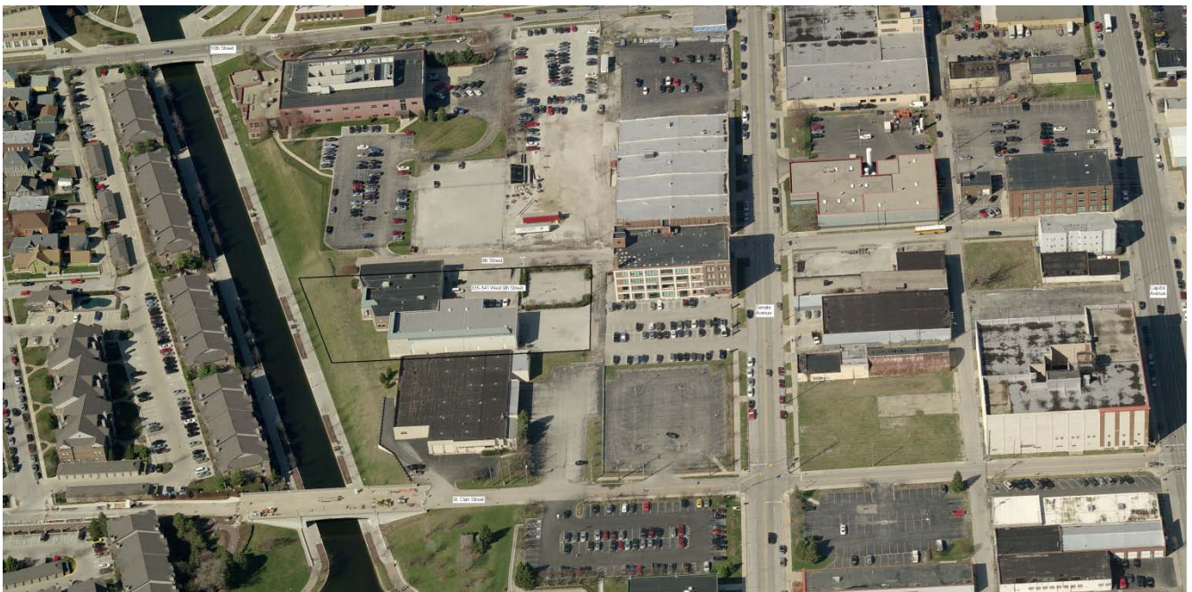
Zoning aerial (above) and oblique aerial from the south – 2011- REG-151