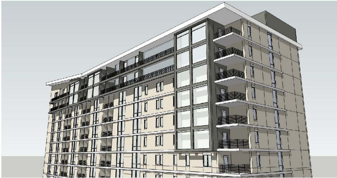
Top of Tower, Southeast Perspective

395 WEST NINTH STREET CONCEPTUAL DESIGN ©2011 RATIO Architects, Inc. 12.05.11