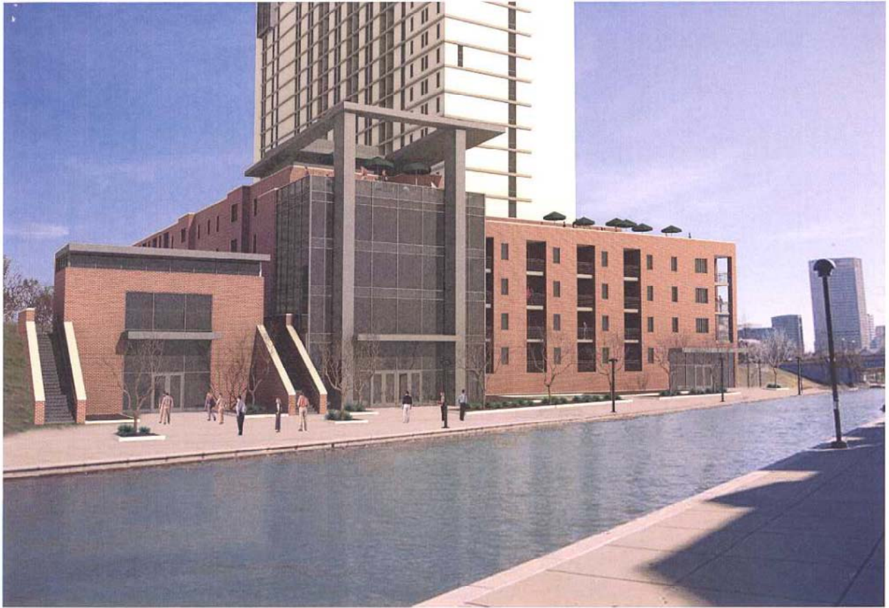
Rendering from canal looking toward the southeast - 2011-REG-151