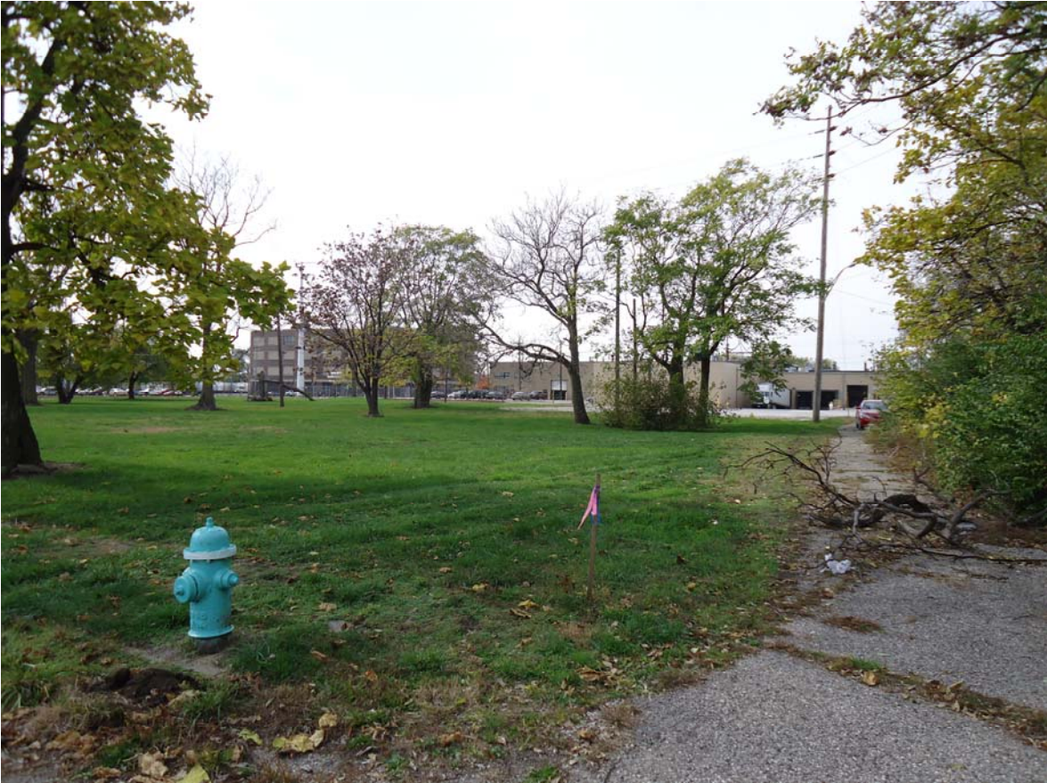
1) Looking east along Marlette Drive.