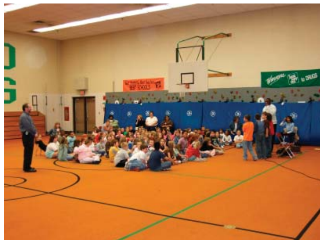
Meeting with the kids at Lynwood Elementary for Seerley Creek Park.