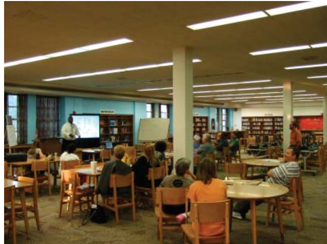
Grassy Creek Regional Park Masterplan Meeting