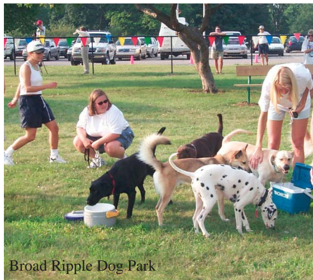
Broad Ripple Dog Park

Maintain and enhance parks, open space and waterways that provide for the needs of area residents, workers and visitors and positively contributes to the overall image of the city. Needs of residents could be met by this goal if further investigation of park and programmable open space is done in regional center and new parks are developed. Examples of sites needing investigation are former Market Square Area and Canal Park opportunities. (See Identified Needs and Implementation & Action Plan sections for more discussion on Regional Center)